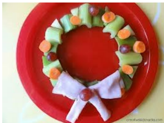
This celery and carrot wreath could easily be done with melons as well