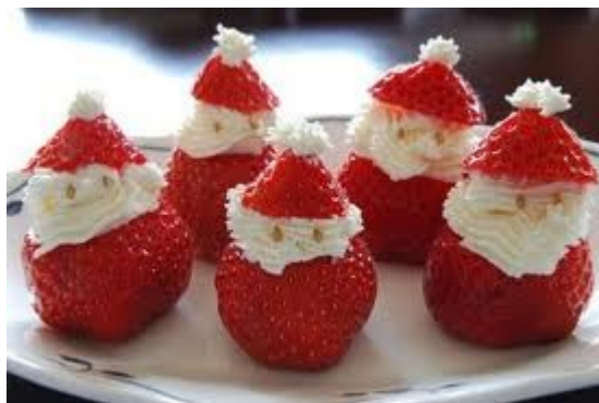
Strawberries make a cute Santa!