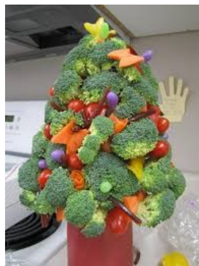
Broccoli is the star of this tree!