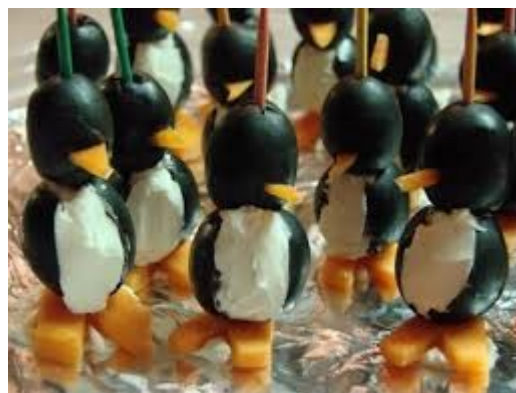
Olives, cream cheese and cheddar all add up to one yummy penguin!