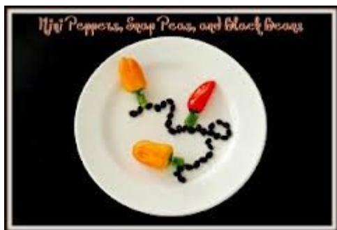
Raisins and mini peppers strung across